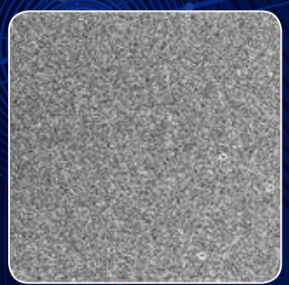
17 microns thick Copper foil with 19 microns of Lithium (x 500).