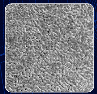
Battery separator material "Celgard" with 2.5 microns of Lithium (x2000).

PVD processing has an important feature: the less metal is required, the lower is the product cost. As a result, there is cost advantage with PVD coated Lithium in comparison with conventional rolling.